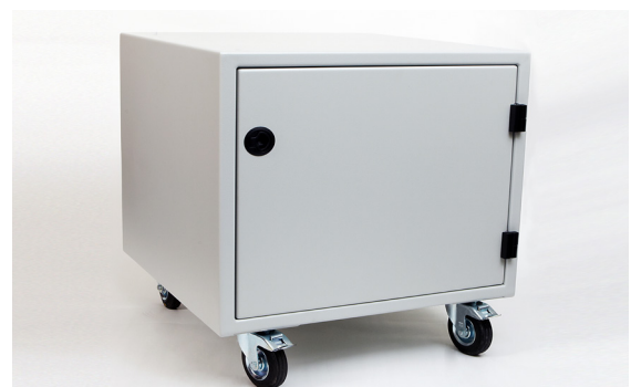
Base / Storage Cabinet

A large base cabinet, convenient for storing manuals and tools is available as an option. The cabinet is equipped with heavy duty locking swivel casters enabling the 100X to be easily moved wherever you need it.