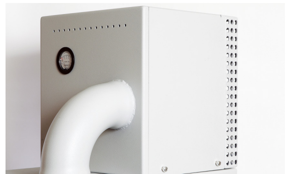
Local Exhaust Module

The 100X can be supplied with an optional local exhaust module to filter all aerosol exhaust when facility exhaust ducting is not available. The local exhaust module is designed with a convenient differential pressure gauge to help determine when to replace the internal HEPA filter.